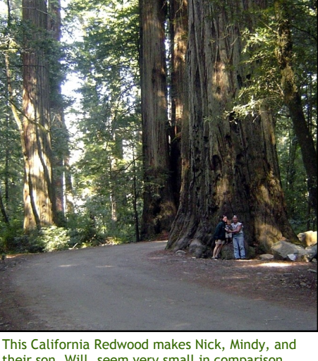
their son, Will, seem very small in comparison.